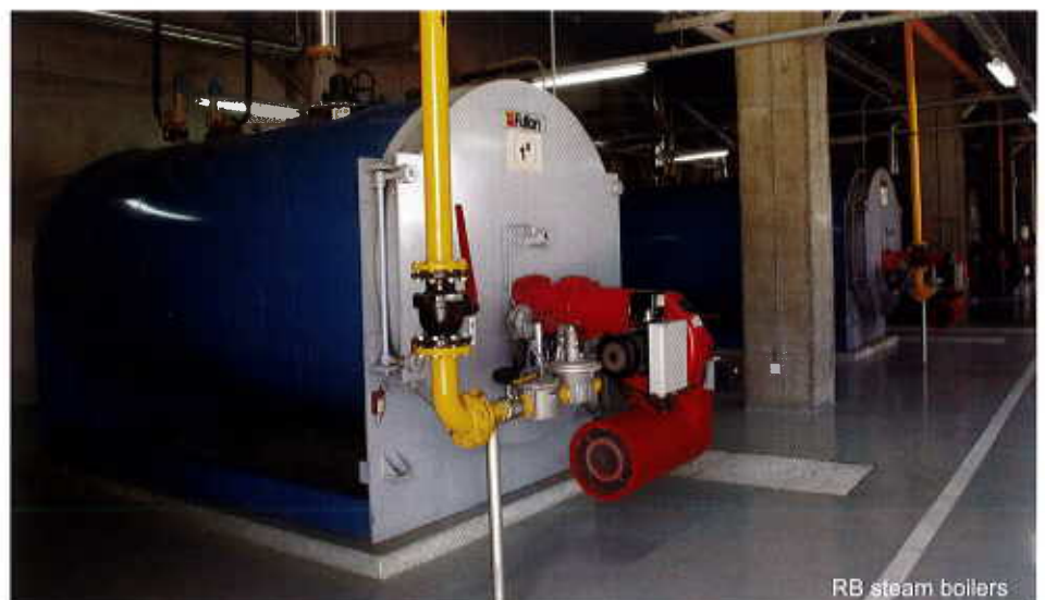
RB steam boilers

Access must be available around and above the boiler for service and maintenance purposes.