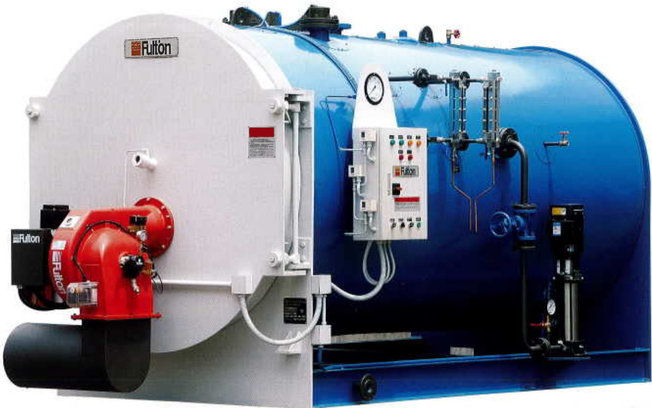
The above boiler built to ASME code

Built/certified in accordance to BS2790 or ASME Boiler and Pressure Vessel Code