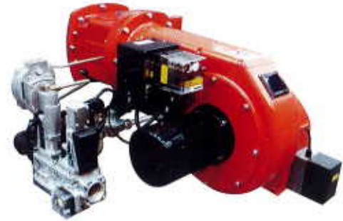
Fully matched burner

Fulton RB boiler is a wet-back horizontal boiler. Fuel is injected from the burner into the combustion chamber and is ignited and burned. Long and narrow flame transfers heat to combustion chamber walls by