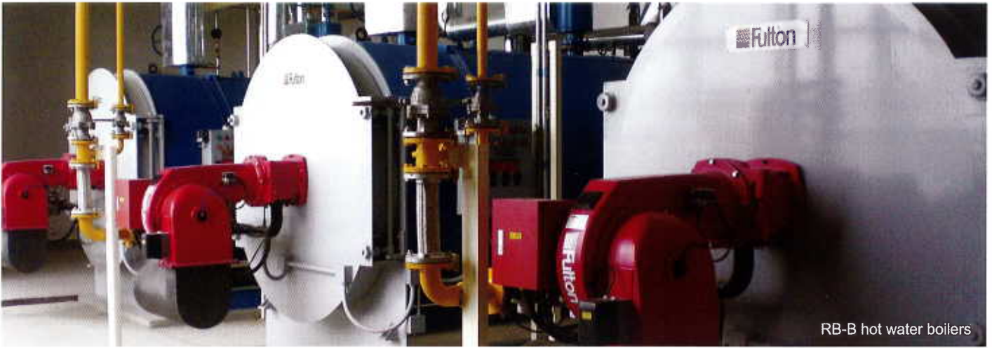
RB-B hot water boilers