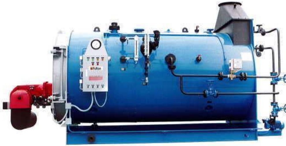
RB boiler with optional ancillaries